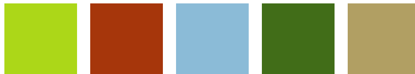
Lime Green Fiesta Red Beach Blue Fresh Green Sand Yellow