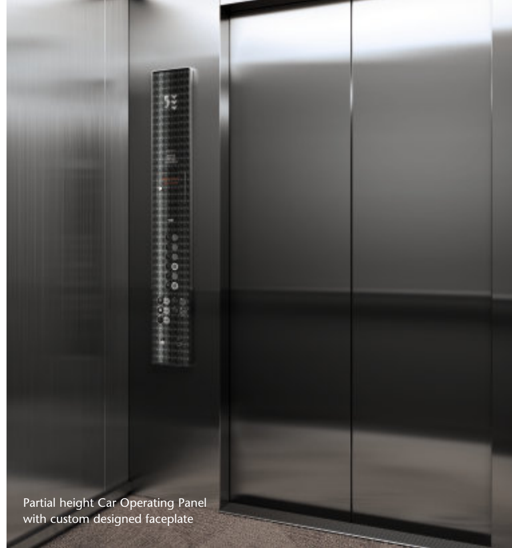
Partial height Car Operating Panel with custom designed faceplate