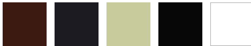
Plum Red Federal Blue Cement Gray Ivory Black Snow White